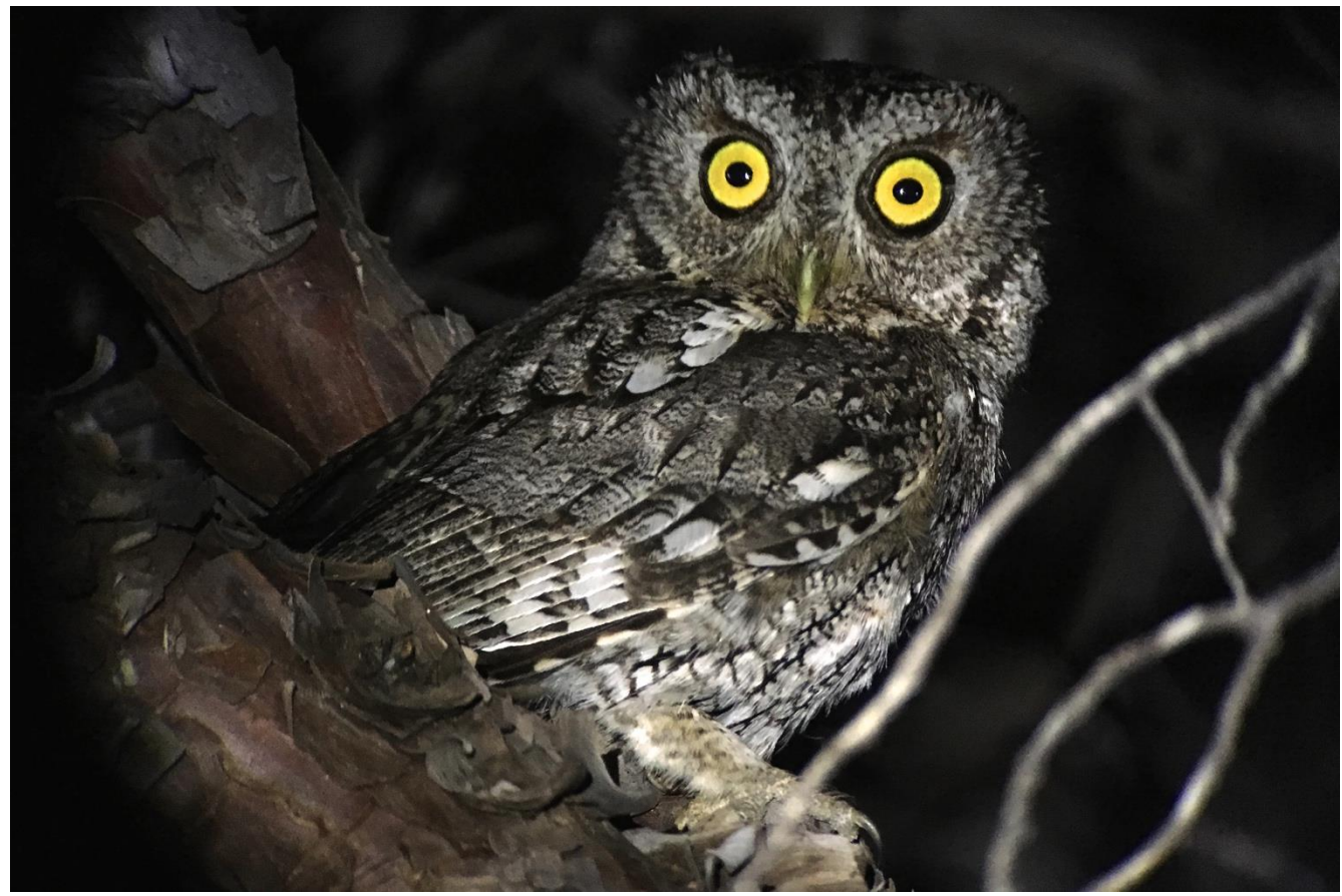
Whiskered Screech-Owl

After lunch, we will try to take a mid-afternoon break to recharge for the evening activities. Late in the afternoon we will head back to Madera Canyon for a picnic dinner and our first owling excursion. Elf Owl, Western and Whiskered screech-owls, Common Poorwill, and Lesser Nighthawk will all be sought.