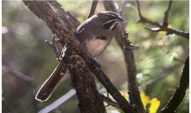
Five-striped Sparrow

NIGHT: Best Western Sonora Inn & Suites, Nogales