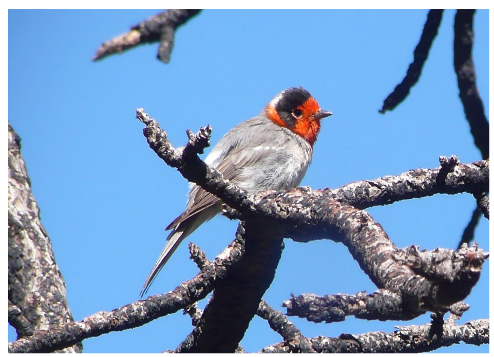
Red-faced Warbler